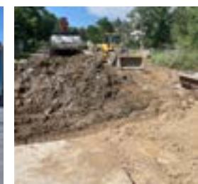
Calibre Staff While Employed Elsewhere